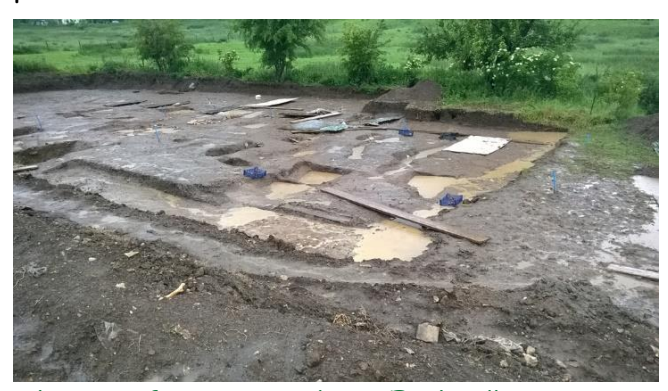
The joy of a summer dig in England!

A second area revealed part of the limestone metalled side road, flanked on its eastern side by a Roman stone-founded building; presumably, a standard strip building. The exciting thing was that this building was cut through by a later stone building with an internal drain that produced a coin of post-medieval date. This building is assumed to be part of the original post-medieval farm complex, but it was not shown on the well-known estate plan of 1756 and must have been erected and demolished prior to that period.