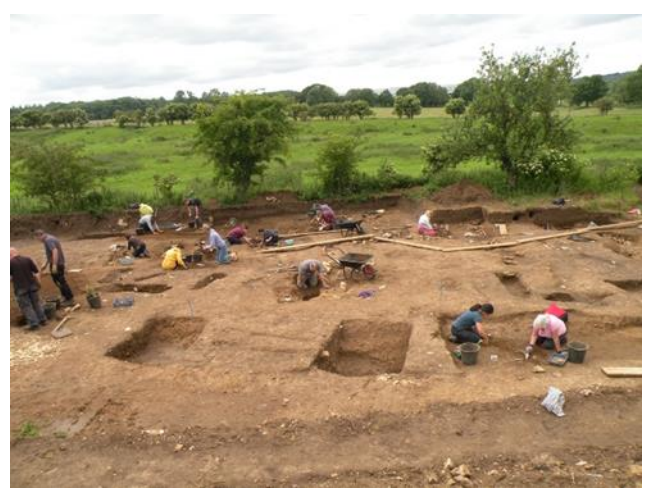
The 2019 excavations

Work was continued within the former orchard area associated with the main Chester Farm house. This was already known to be the site of a Roman burial area and previous excavations had recorded 32 burials that, apart from one notable decapitated example, all lay supine and aligned west to east.