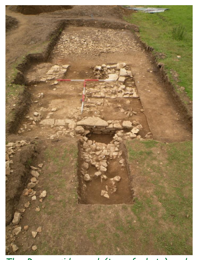
The Roman side road (top of photo) and a Roman building cut by a post-medieval building and drain (foreground)

The focus of the excavation last summer was therefore on trying to complete the excavation of the burials and to start the exploration of a section of a Roman side road that ran through what is now the orchard. In the first area, a further 32 burials were revealed and lifted. These included many children and babies all carefully arranged and some graves in which skeletons appeared to overlie each other. It also contained burials