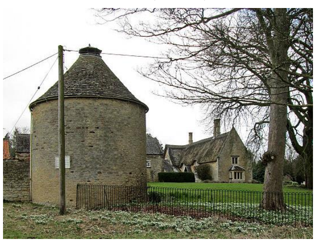
Cranford St Andrew, Dovecote

Northamptonshire Council), cemetery chapels (for example Kingsthorpe Cemetery Chapel, Northampton Borough Council and Kettering Cemetery Chapel, Kettering Borough Council). farmhouses (for example Rectory Farm, Northampton Borough Council), stable blocks (East Carlton Country Park, Corby Council), example Bradlaugh barns (for Northampton Borough Council), art galleries (for example Alfred East Art Gallery, Kettering Borough Council) and shops (for example 57 High Street, Corby Old Village, Corby Council). Ancient monuments, though considerably fewer in number, ranged from sites like Borough Hill, on the eastern side of Daventry (Daventry District Council), Bury Motte (South Northamptonshire Council) to a section of Roman road at Hazelwood part of Gartree Road, in Corby (Corby Council).