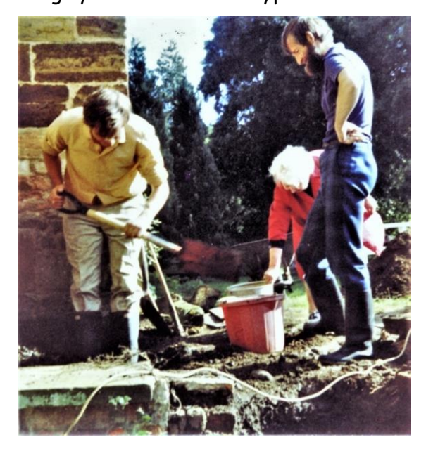
Members of the History Society during excavations in 1983

a piece of Samian ware and a fragment of what he called a Roman cinerary urn. This report, especially the reference to arches, begs the question of whether the chancel is built on top of the foundations of a Roman heating system known as a hypocaust?