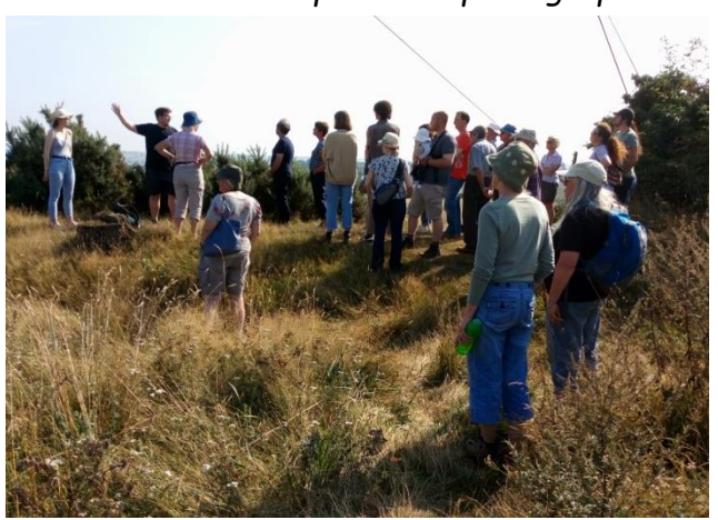
Views of the hillfort bank and ditch