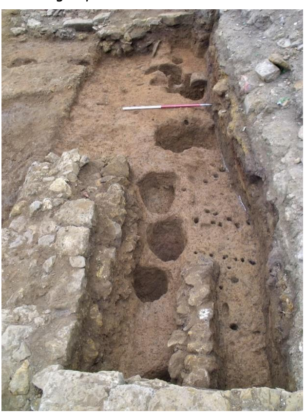
Carver's workshop, looking south-east

included). The postholes indicate that it was at least 4.5m wide and more than 3.0m long, extending beyond the site.