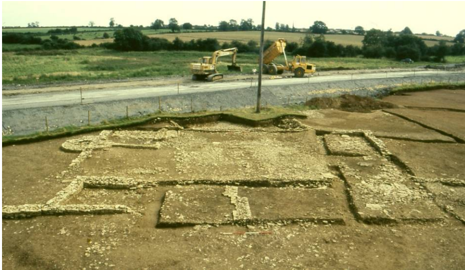
West Cotton, Raunds under excavation in the 1980s

at St Matthew's Parish Centre, The Drive, Kingsley, Northampton NN1 4RY