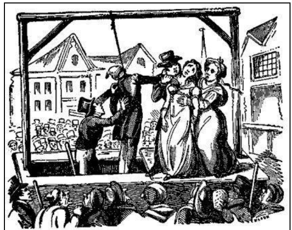
A woodcut from the Newgate Calendar, which shows the hand of a newly hanged man being applied to a young woman in an effort to cure a disease of the neck.

A new major research programme funded by the Wellcome Trust is bringing Leicester academics in the School of Archaeology and Ancient History, and the School of Historical Studies together with colleagues from the University of Hertfordshire and Oxford Brookes University to examine the fate of the corpses of executed criminals.