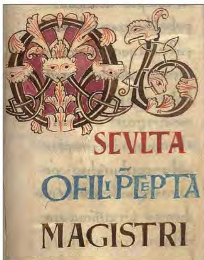
A late 10th-century manuscript copy made in England of the 6th century monastic rule of St Benedict; London: British Library, Harley 5431, fol. 7r