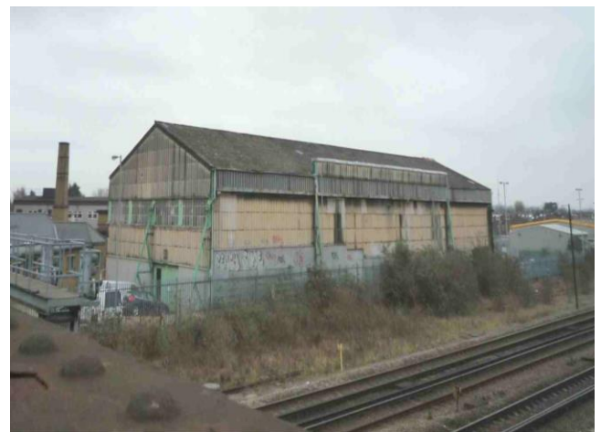
Seaplane hanger relocated to Wimbledon