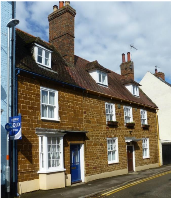
Park Street, Towcester