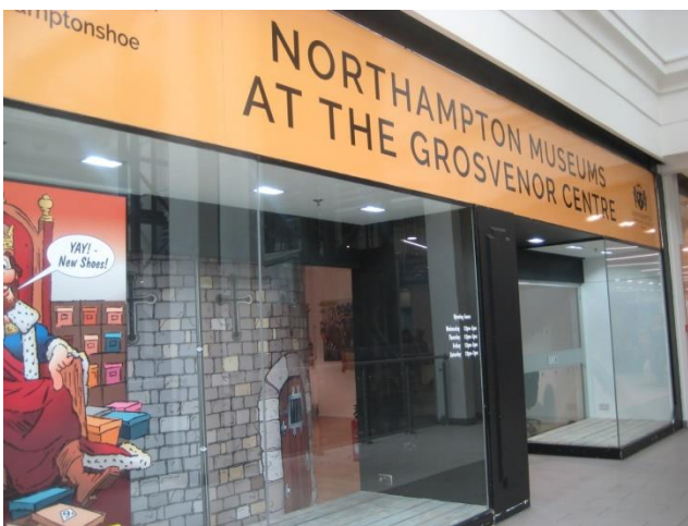
The 'pop-up' museum in the Grosvenor shopping centre

Northampton Museum is currently undergoing extensive renovation. However, to overcome this lack of an accessible space and to engage with the public over the school holidays, the museum hosted a temporary exhibition in an empty shop in Northampton's Grosvenor Centre this Summer.