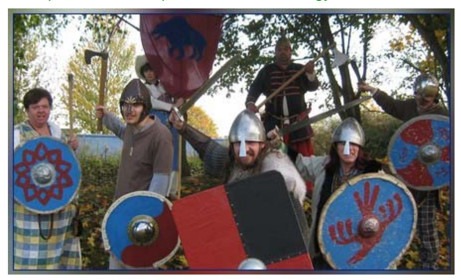
Local Viking historical re-enactors The Bifrost Guard will be in their winter camp in the grounds of the Museum!

Northamptonshire Archaeological Society is hosting a public open day to help spread the word that Northamptonshire has a rich and diverse history, and to make people aware of the many local societies that they could become involved with. Members of local archaeological and historical groups will provide displays of their work and finds, and will be on hand to talk to the public about the archaeology and history of Northamptonshire. There will be handouts available and publications for sale. Other groups involved will include: Northamptonshire Archaeological Society, Community Landscape and Survey Project (CLASP), Northamptonshire Industrial Archaeology Group and Northamptonshire Archaeology.